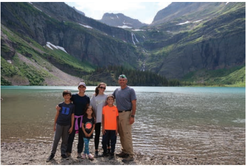
A family trip to Glacier National Park in 2019