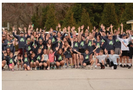
Incredible turnout for the “Rise Up for Jennifer 5K”