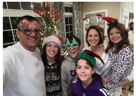
Saunders Family Christmas 2020