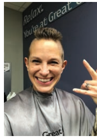
Making the most of chemo hair loss with a fun Mohawk